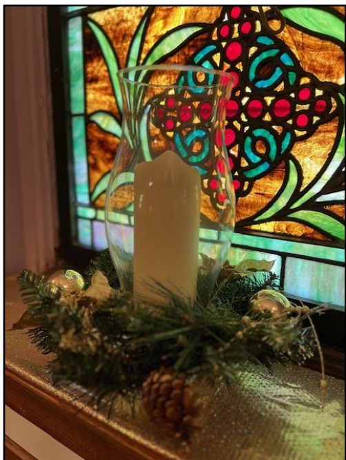
Hanging of the Greens, November 30