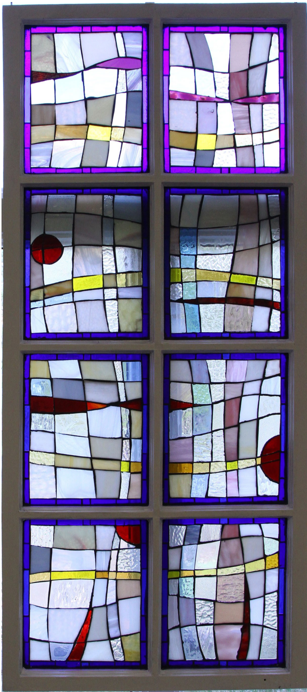
Fractured and Redeemed mosaic stained glass 22 x 52"