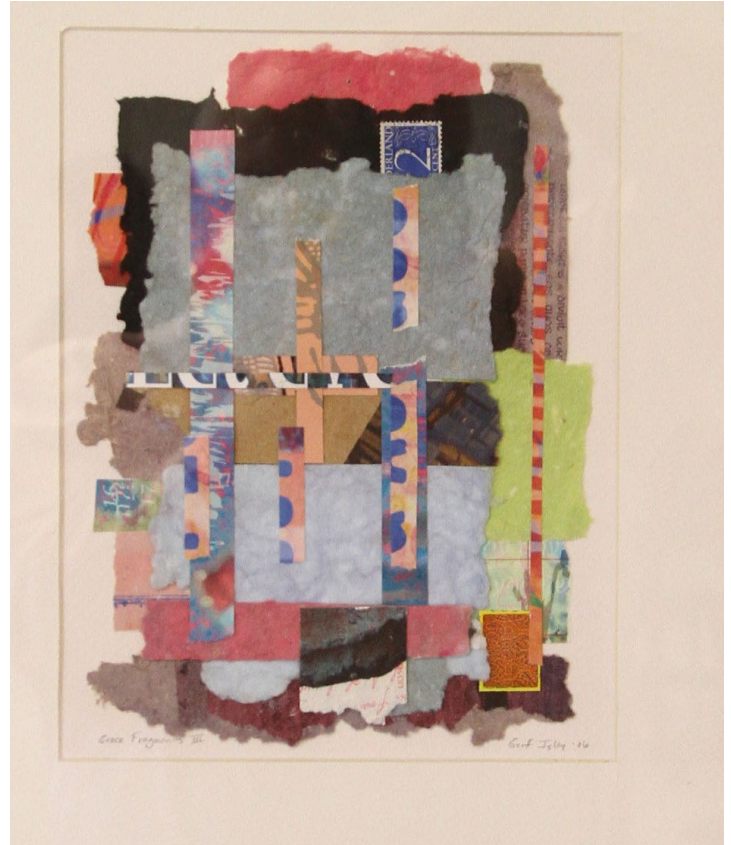
Fragments of Grace III Mixed media, handmade paper, 2007