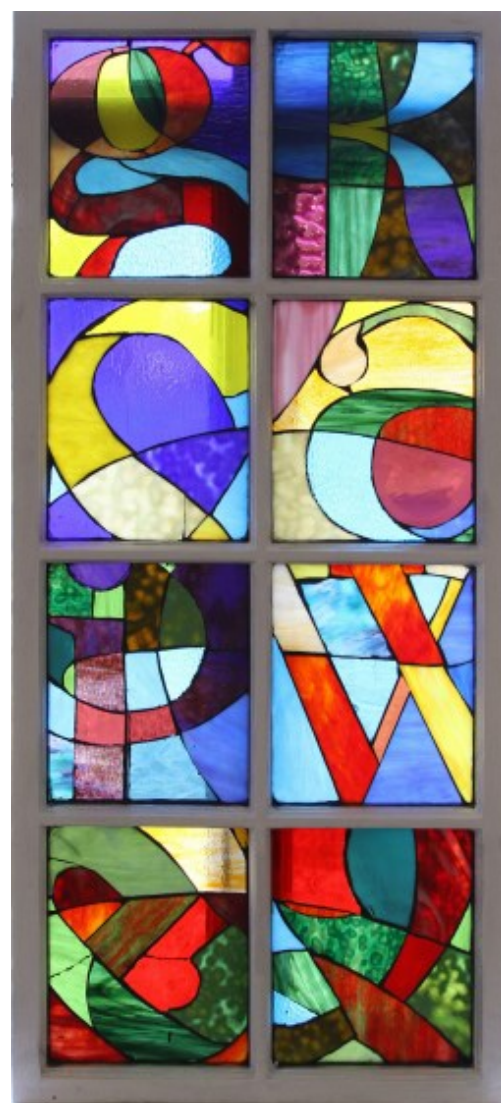
Psalms of Grace II Mixed media, handmade paper, 2007