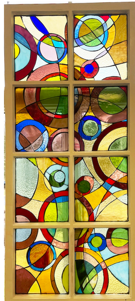
Circles of Light mosaic stained glass

Machine pieced, hand dyed, machine quilted, 2023 30 x 32"