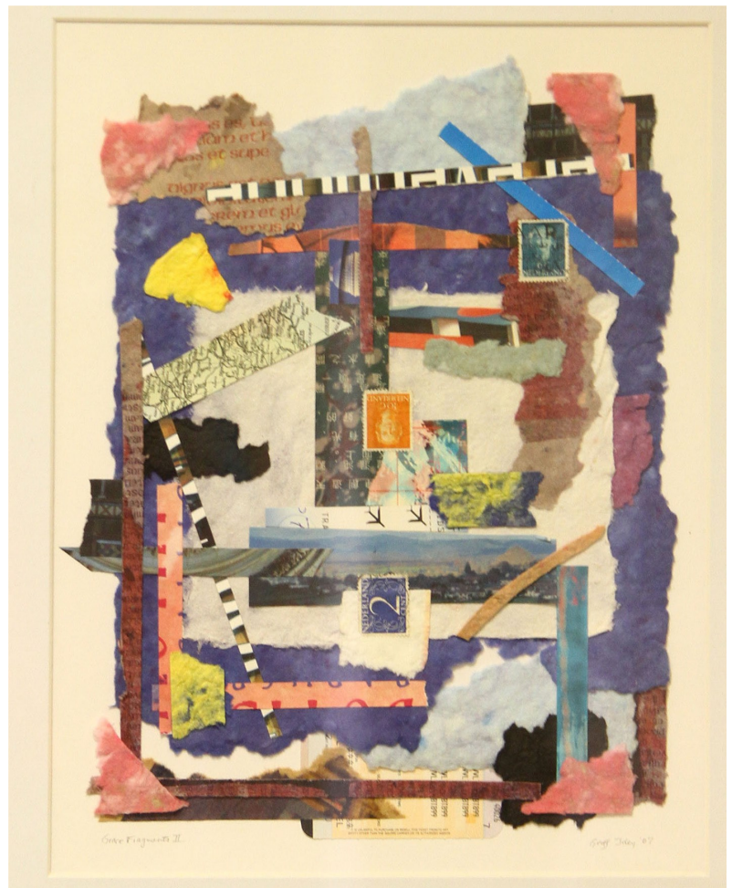
Fragments of Grace II Mixed media, handmade paper, 2007 8 x 10"